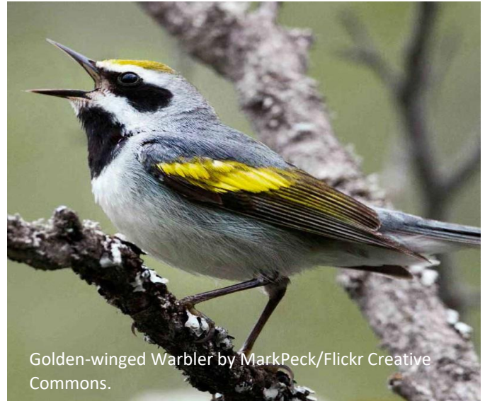
Golden-winged Warbler

Nicaragua: Nicaragua is home to a total of 706 bird species, of which 190 are migratory. The highland cloud-forest ecosystems and lowland rainforests of Nicaragua provide important wintering areas for several species of migratory birds, including the Golden-winged Warbler, and stopover areas for many species like Bay-breasted Warbler and Canada Warbler. Nearly all the Golden-winged Warbler Focal Areas identified for Nicaragua are in this region. The work in Nicaragua will contribute to two of the five strategies in the Conservation Investment Strategy for the Mid-Elevation Forests of Central and South America: strengthening small-scale sustainable agriculture and influencing local people's behaviors to have a positive relationship with nature. The budget for this year is $58,000. Focal species include golden-winged warbler, wood thrush, golden-cheeked warbler, and more. State agencies with SGCN connections include most states east of the Mississippi River and AR, IA, LA, MN, MO, NE, ND, OK, SD, and TX.