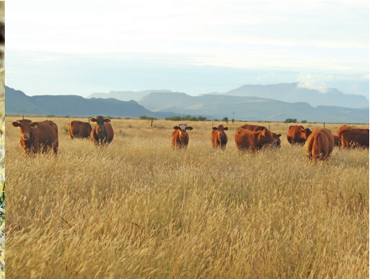
VALLES CENTRALES GPCA (CHIHUAHUA, MEXICO) - MAURICIO DE LA MAZA

Southern Wings was modeled after state involvement in Canada through the North American Waterfowl Management Plan and North American Wetlands Conservation Act- a highly successful collaboration investing funds to conserve the breeding grounds of waterfowl. Southern Wings sets the stage for international collaboration south of the U.S. by bringing state fish and wildlife agencies together with colleagues beyond our national borders to generate shared benefits for state-priority migrant birds. Sustaining bird populations through financial investments in the wintering grounds provides economic and social benefits to the states.