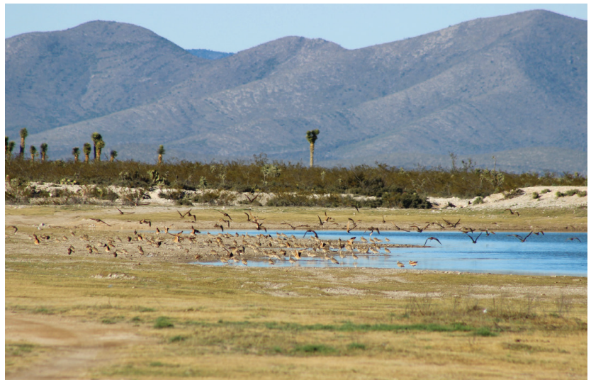
EL TOKIO GRASSLANDS AREA (MEXICO) - ANDREW ROTHMAN

The states of Arizona, Colorado, Montana, and New Mexico have contributed to developing a Sustainable Grazing Network to protect and restore grasslands on private and communal (ejido) lands in Mexico's Chihuahuan Desert. Bird Conservancy of the Rockies' Sustainable Grazing Network engages ranchers in grasslands conservation and management, working collaboratively to support their transition to more efficient and sustainable production practices, and enhancing habitat for birds. Since 2013, 15 ranches representing 612,000 acres have been enrolled in this network. They have demonstrated increases in Sprague's pipit numbers on SGN lands.