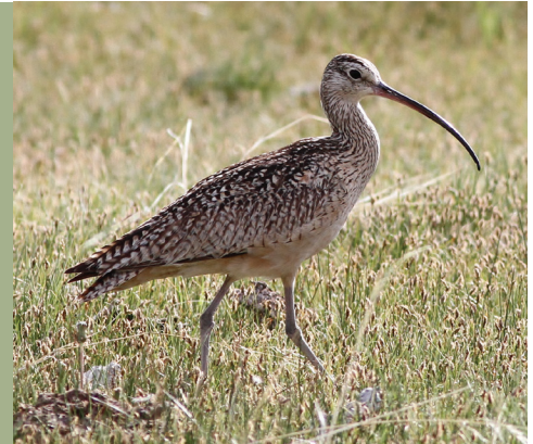
LONG-BILLED CURLEW - ALEX LAMOREAUX

Almost half of the native landbirds (418 species) in North America rely on habitats in at least two of its three countries—United States, Canada, and Mexico. The Chihuahuan Desert supports 90% of migratory species breeding in the western Great Plains, including 27 species recognized as high priorities for conservation, such as Baird's Sparrow and Chestnut-collared Longspur, which winter nowhere else.