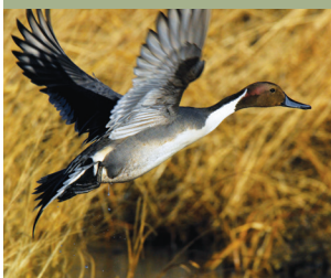
NORTHERN PINTAIL - GEORGE ANDREJKO

Southern Wings was modeled after state involvement in Canada through the North American Waterfowl Management Plan and North American Wetlands Conservation Act- a highly successful collaboration investing funds to conserve the breeding grounds of waterfowl. Southern Wings sets the stage for international collaboration south of the U.S. by bringing state fish and wildlife agencies together with colleagues beyond our national borders to generate shared benefits for state-priority migrant birds. Sustaining bird populations through financial investments in the wintering grounds provides economic and social benefits to the states.