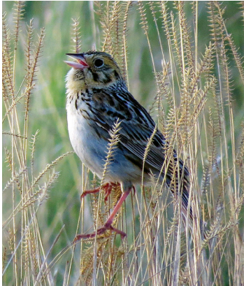
BAIRD'S SPARROW - SASHA ROBINSON