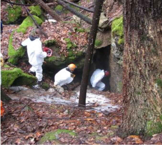
Scientists enter abandoned mine where bats hibernate in New York.