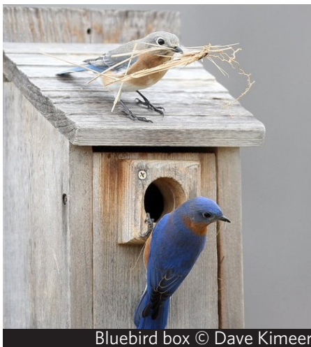
Bluebird box