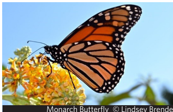
Monarch Butterfly

Historically, a significant portion of North Carolina was considered 'prairie' habitat; less than 1% currently remains. In the early 1500's, European settlers detailed the existence of prairie-type openings across the Piedmont region. In 1540, Hernando de Soto wrote of large swaths of un-forested areas that were easily navigated on horseback with abundant amounts of grass. In 1718, a French explorer, Guillaume Delisle, reported the landscape as a sparsely forested, open grassland containing bison and elk, present from the Neuse River to the foot of the mountains.