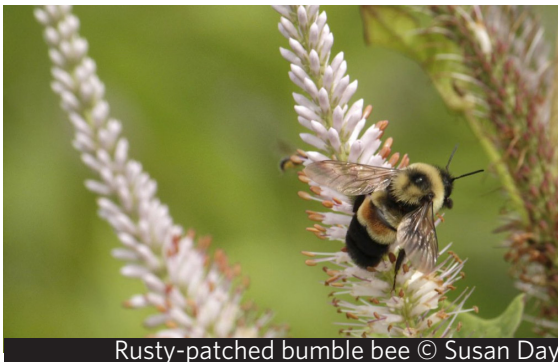
Rusty-patched bumble bee