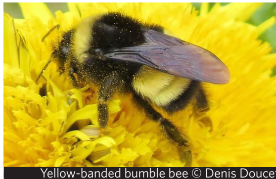
Yellow-banded bumble bee