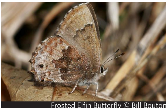
Frosted Elfin Butterfly