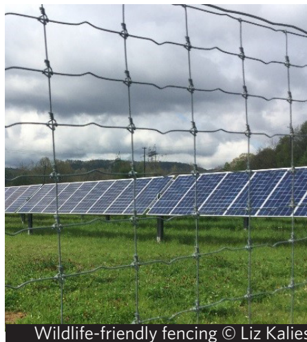
Wildlife-friendly fencing