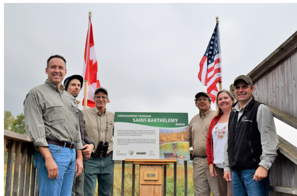
Virginia DGIF tours southern Quebec

The Association re-affirmed its commitment to waterfowl habitat conservation and to the $10 million per year goal in both 2005 and 2011. This report provides Association members with a national update on their contributions toward the AFWA goal.